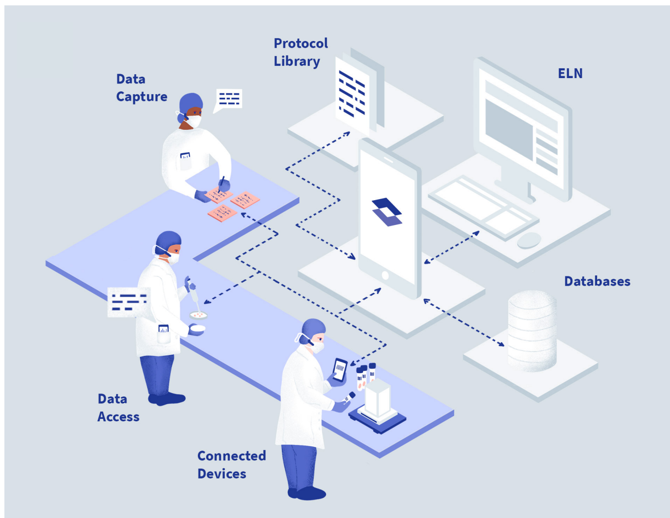
Fig.3: Digital lab assistants as a hub between scientists at the bench and lab informatics.