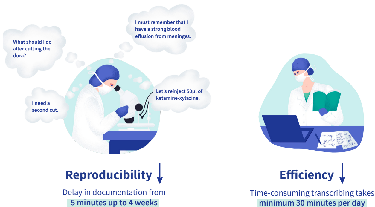
Fig.1: Challenges of documenting with ELN.