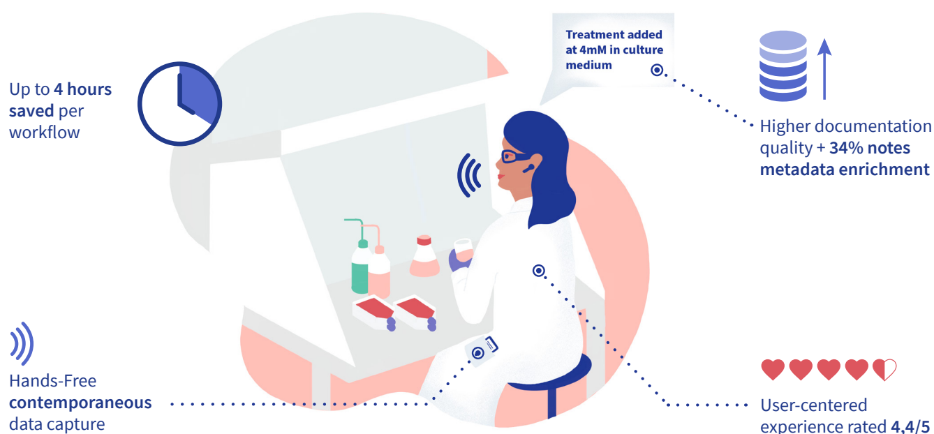
Fig.2: Digital lab assistants as a lab companion.

As a practical assistant for all types of lab work, LabTwin includes smart tools such as voice-activated timers, calculations, and error-preventing systems, which can be seamlessly incorporated within the workflow. With hands-free data capture and access in real time, LabTwin increases efficiency by saving time, reducing errors and ensuring overall data integrity.